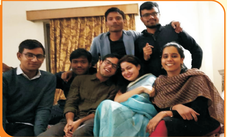
A Selfie at University of Maryland, USA