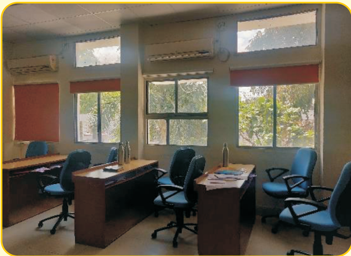
The classroom after a long day

Looking forward to a much awaited Bharat Darshan and for an even better Phase III!