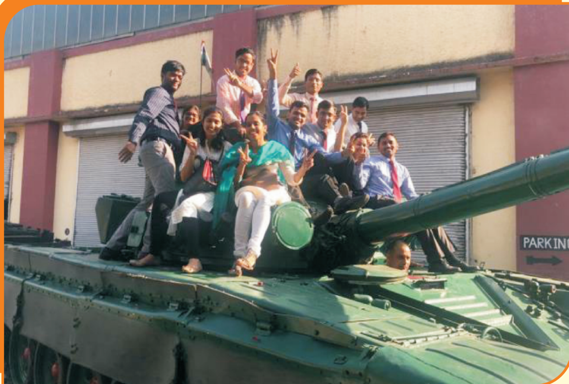
A tank ride on T-72