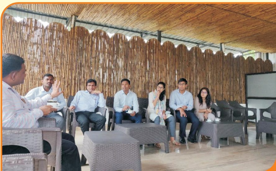
Chai Pe Charcha in Tea Square