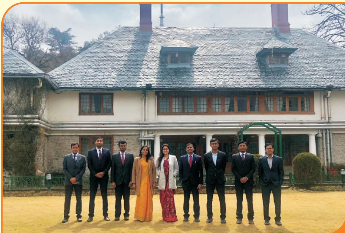
Attachment at NAAA, Shimla