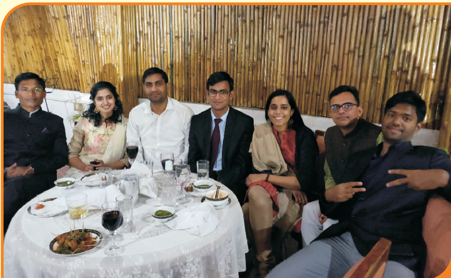
Welcome Dinner at NADFM