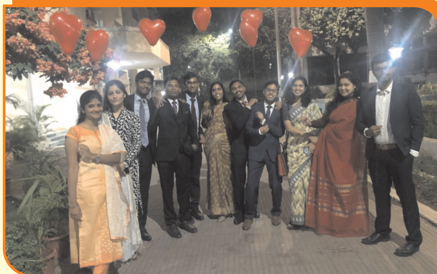
A Merry Christmas!